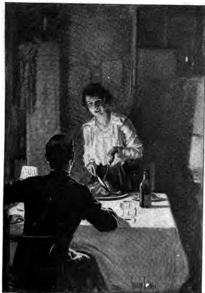
MOIRA TALKED GAYLY